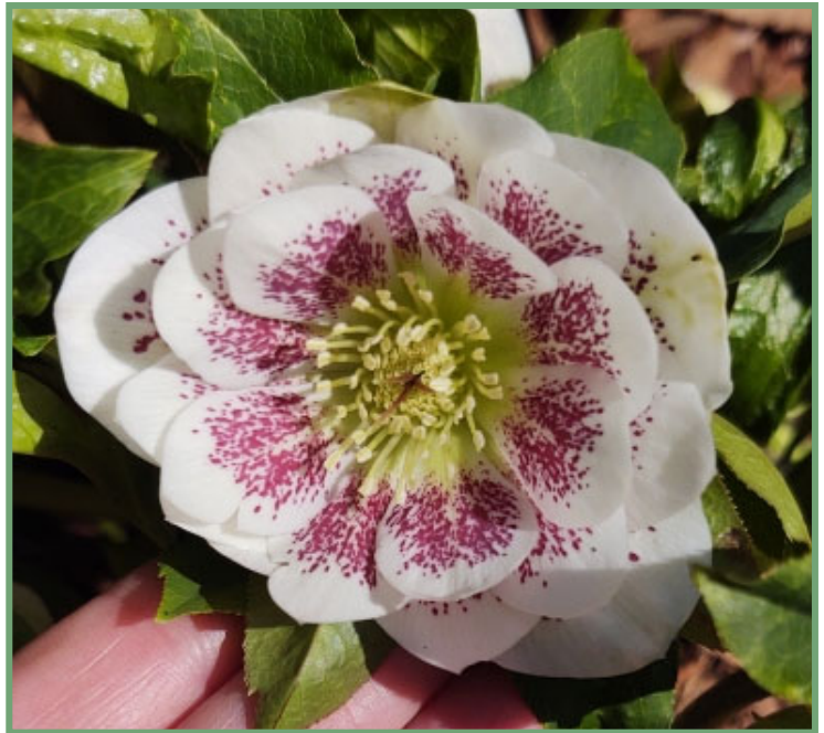
'Confetti Cake' Hellebore (above) and 'Diana Clare' lungwort ( Pulmonaria , below)