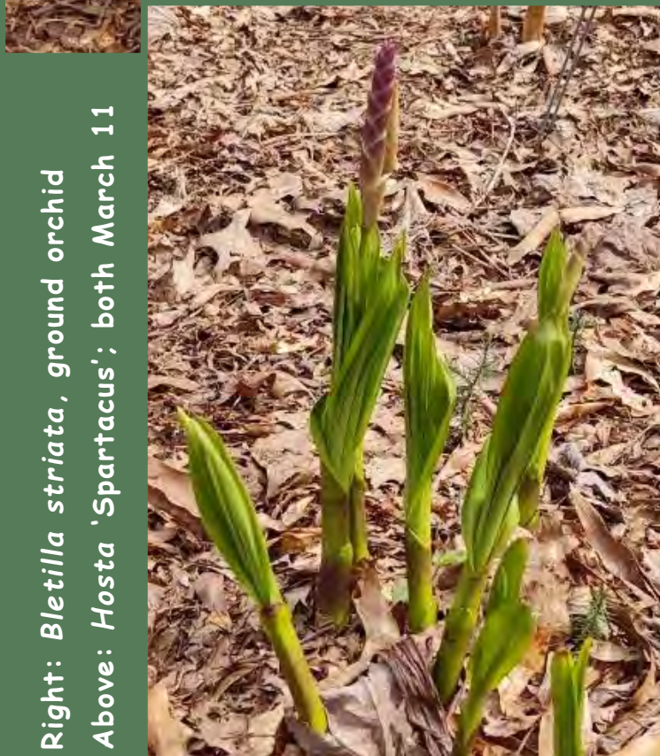
Right: Bletilla striata , ground orchid Above: Hosta 'Spartacus'; both March 11