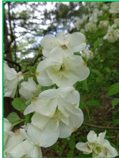
From Nancy Robinson, double dogwood found at a plant sale in Oak Ridge. Neighbors don't know it's a dogwood!