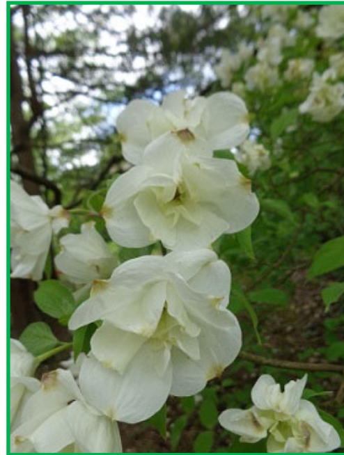
From Nancy Robinson, double dogwood found at a plant sale in Oak Ridge. Neighbors don't know it's a dogwood!