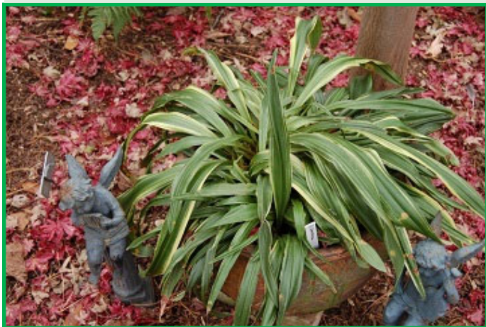
R. Gunjaku 2013 Tranquility

Oddly enough, tissue culture of Rohdea has been an utter failure and given the current prices of Rohdea in Japan, there is little interest in tissue culture. The Japanese grow and show Rohdea . The Chinese scientifically study the genus, and the chemical Rohdexin which is used to treat heart disease.