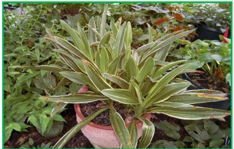
R. Go DaiShu 2010

Rohdea and Hosta are taxonomically, closely related. Rohdea is even more closely related to Aspidistra , Convallaria , Polygonatum and Sansevieria .