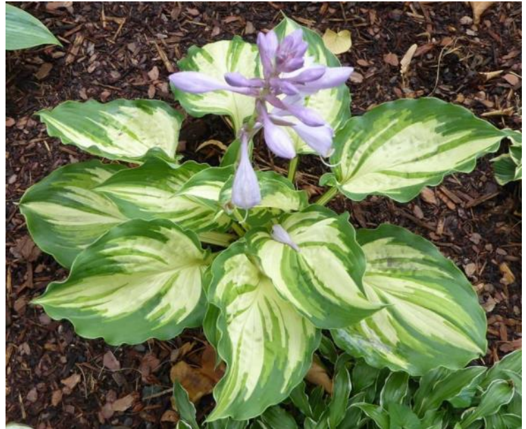
Lakeside Paisley Print

Every year since 1996 the American Hosta Growers Association (AHGA) has named a Hosta of the Year. The selected hosta must grow well in all regions of the country, be widely available in sufficient quantity, and retail for about $15.00 in its year of selection.