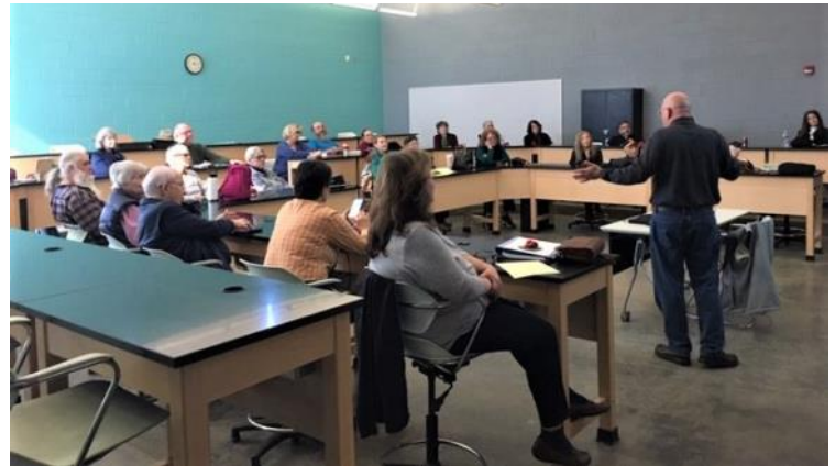
A well attended February meeting to learn about the program for the year and some facts about Camellias.

Plan to attend this Sunday's meeting (24th) at the UT Gardens Greenhouse Rooms at 2.00pm.