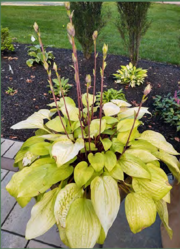
'Designer Genes' in a little too much sun! She knows to move it!