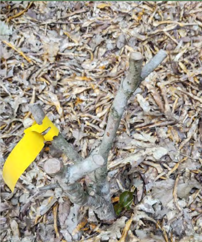
Camellia sasanqua 'Moonshadow' finally sprouts after severe dieback from the Great Holiday Freeze of 2022. It is not grafted.