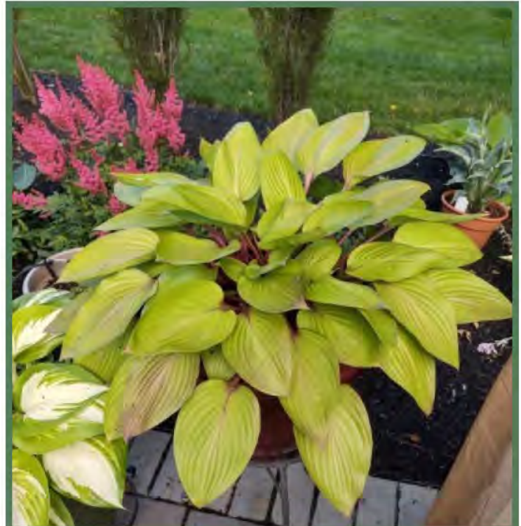
Hosta 'First Blush' on May 23, 2023 (left) and July 7, 2023 (right).