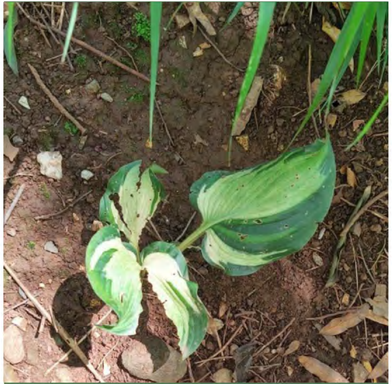
Compare on previous page to 'Hans'. This is one in my yard. Both plants, the one in Central Ohio and mine, were purchased at the same time, same vendor.