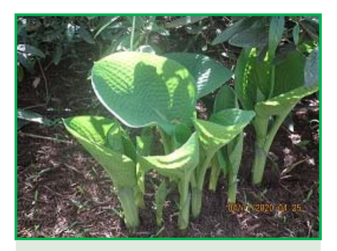
From Alan Solomon, emerging hosta.